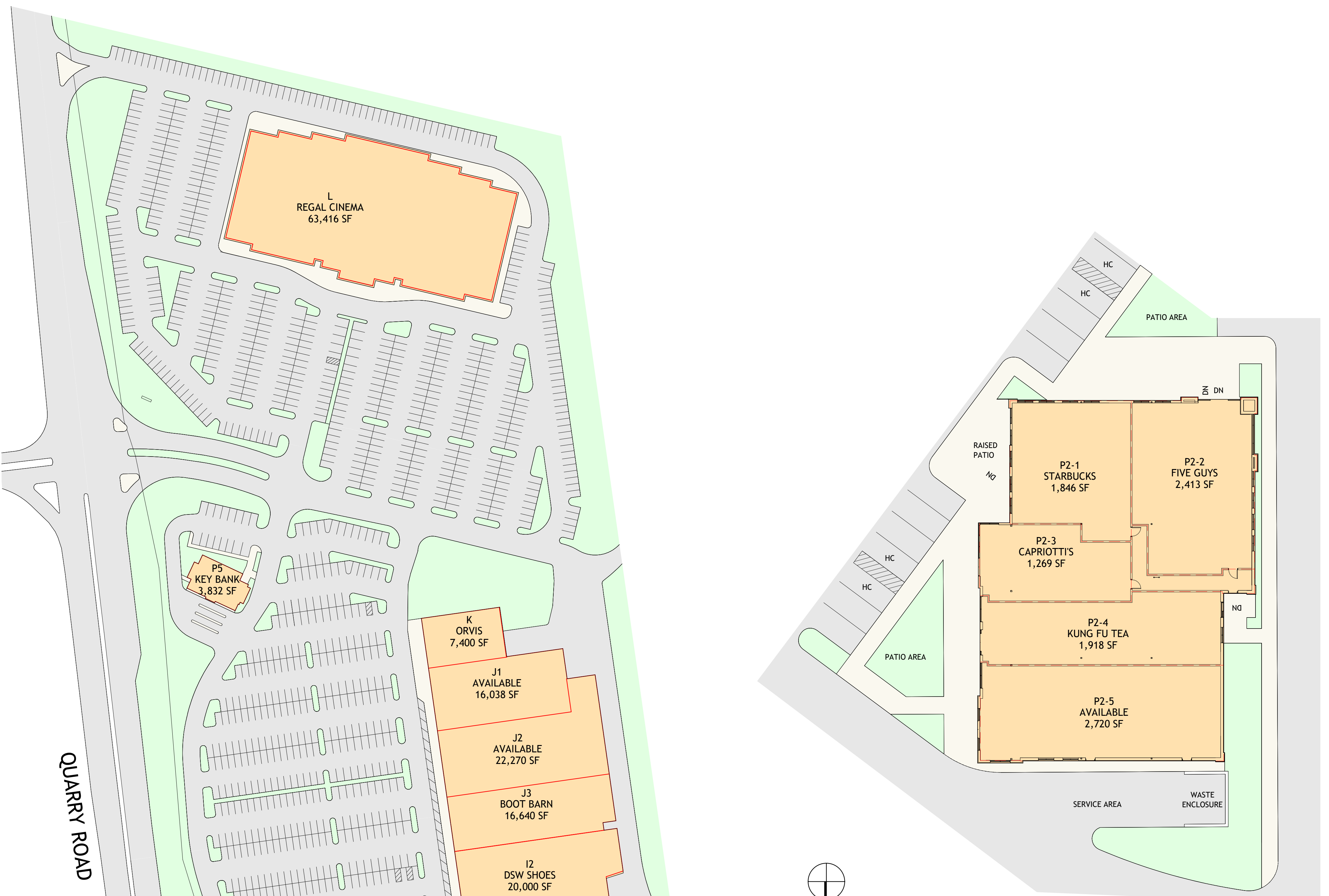
P2 LEASE PLAN- BUILDING P2 SCALE: 1" = 20'-0"

THIS INFORMATION IS FOR LEASING PURPOSES ONLY; SQUARE FOOTAGE MAY VARY.